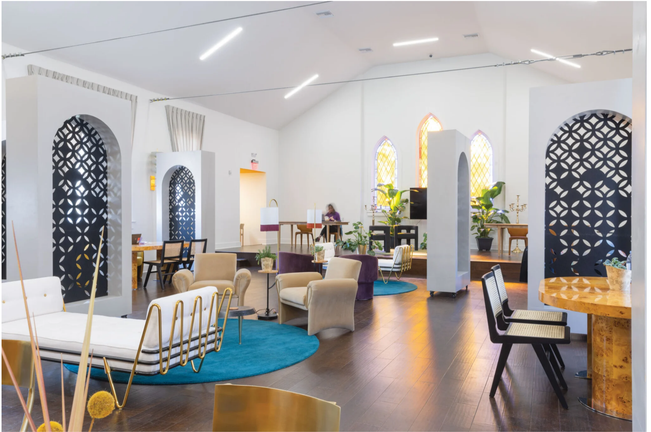
A co-working space dedicated to supporting local professional women, Salon22 occupies the main area of what was once a Mid-City church.

12/29/2023 by Misty Milioto ( https://www.bizneworleans.com/author/misty-milioto/ )