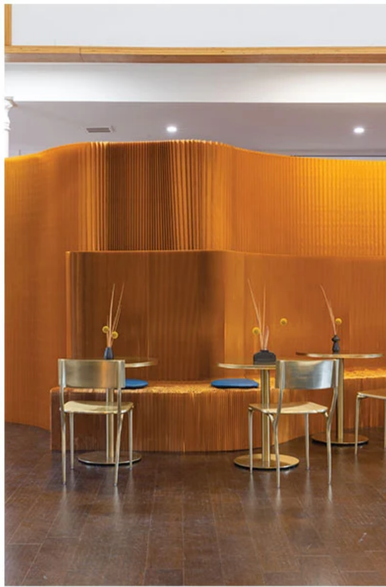
(Left) Salon22 features six distinct working areas, each with their own personalities. (Right) Salon22's carefully designed space harnesses feminine power, providing an environment where women can connect, collaborate, work and create.