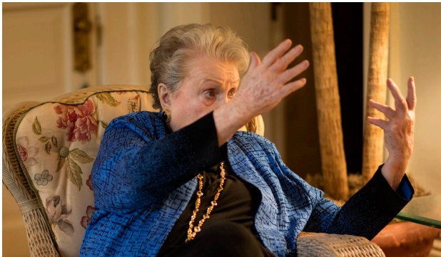
Ella Brennan explains...

“Some people say her secret is her relentless striving, her refusal ever to say it’s good enough.”